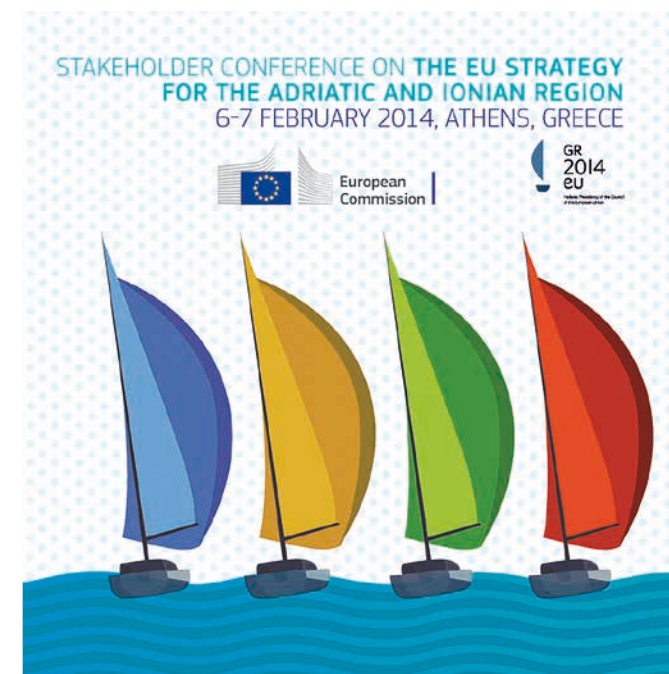
Stakeholder Conference on the EU Strategy for the Adriatic and Ionian Region, Athens, 6-7 February 2014

Combined with other actions, the objective is to create further opportunities for smart, sustainable